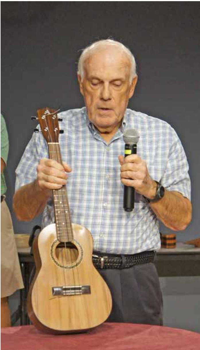
Ukelele by Al Socha