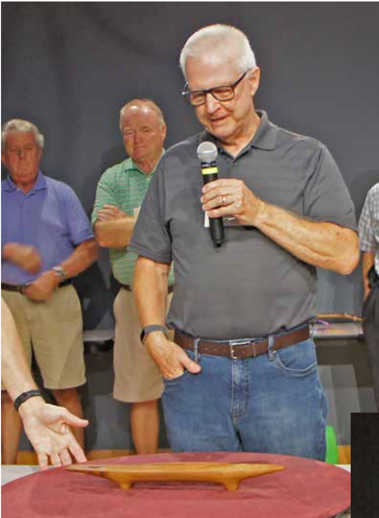
Boat Tray by Bruce Bell