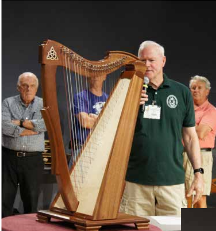
Harp by Buzz Sprinkle