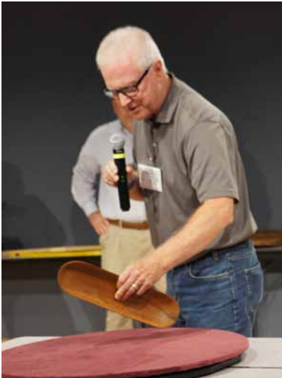
Tray by Bruce Bell