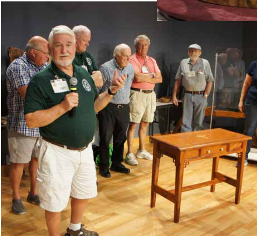
Table by Bob Harvey