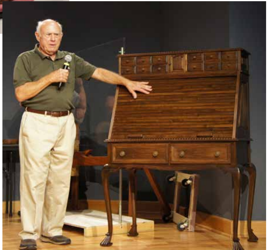
Roll Front Desk by Bobby Hartness