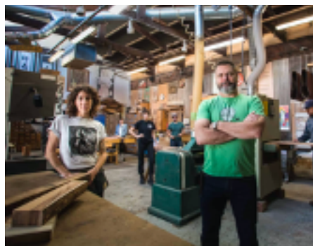
Nick Offerman (Parks and Recreation)

Most notable are Harrison Ford, Adam Carolla, and Nick Offerman (Parks and Recreation). In fact, you can visit Nick Offerman’s shop at www.offerwoodshop.com .