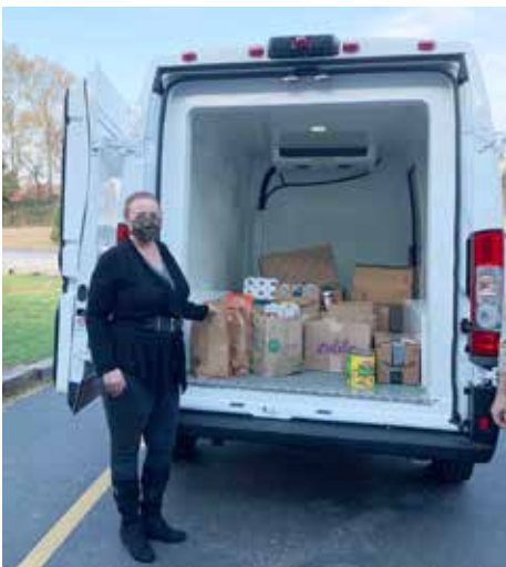
(Below) Food donated by Guild members donated to Loaves and Fishes