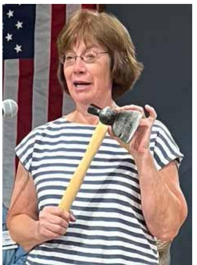
Hatchet - Ash with Walnut Wedge by Karen Sheldon