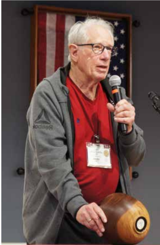
Grain Matched Turned Walnut Bowl by Bill Lancaster