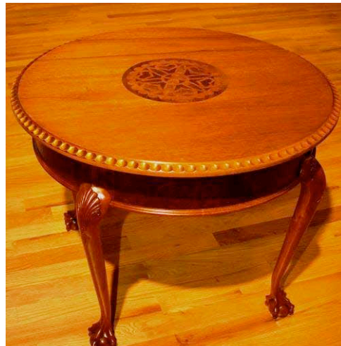
December Show & Tell item:

McKinney Lumber & Hardware (864)-288-6570